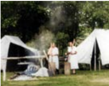
pounding corn taken about 1930:

As an example here is a colorized photo made from a B&W photo of two Lenape women