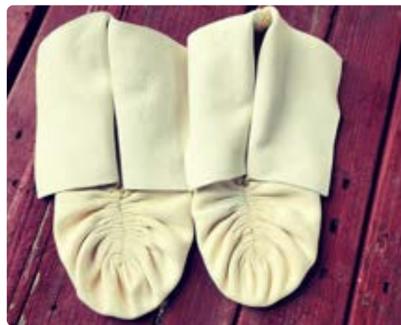
Lenape Pucker Toe Moccasins

We will host a pucker toe moccasin making class in July with 18 participants who have registered. It will be a fun filled day, and each participant will make and complete their very own pair of pucker toe moccasins to take home by the end of the day. More classes will be advertised if you missed out on this one. We will post pictures of everyone's finished moccasins at the end of the class, so keep your eye out to see what your fellow tribal members are accomplishing!