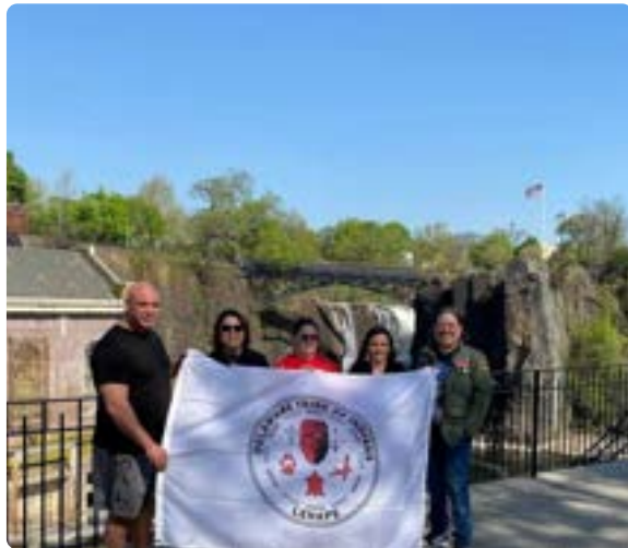
Paterson Great Falls, NJ