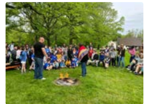
Presenting at Pennsbury

We hope everyone has a great summer! Wanishi!