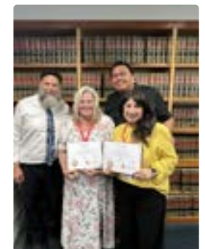
(Left) Group Photo of all participants