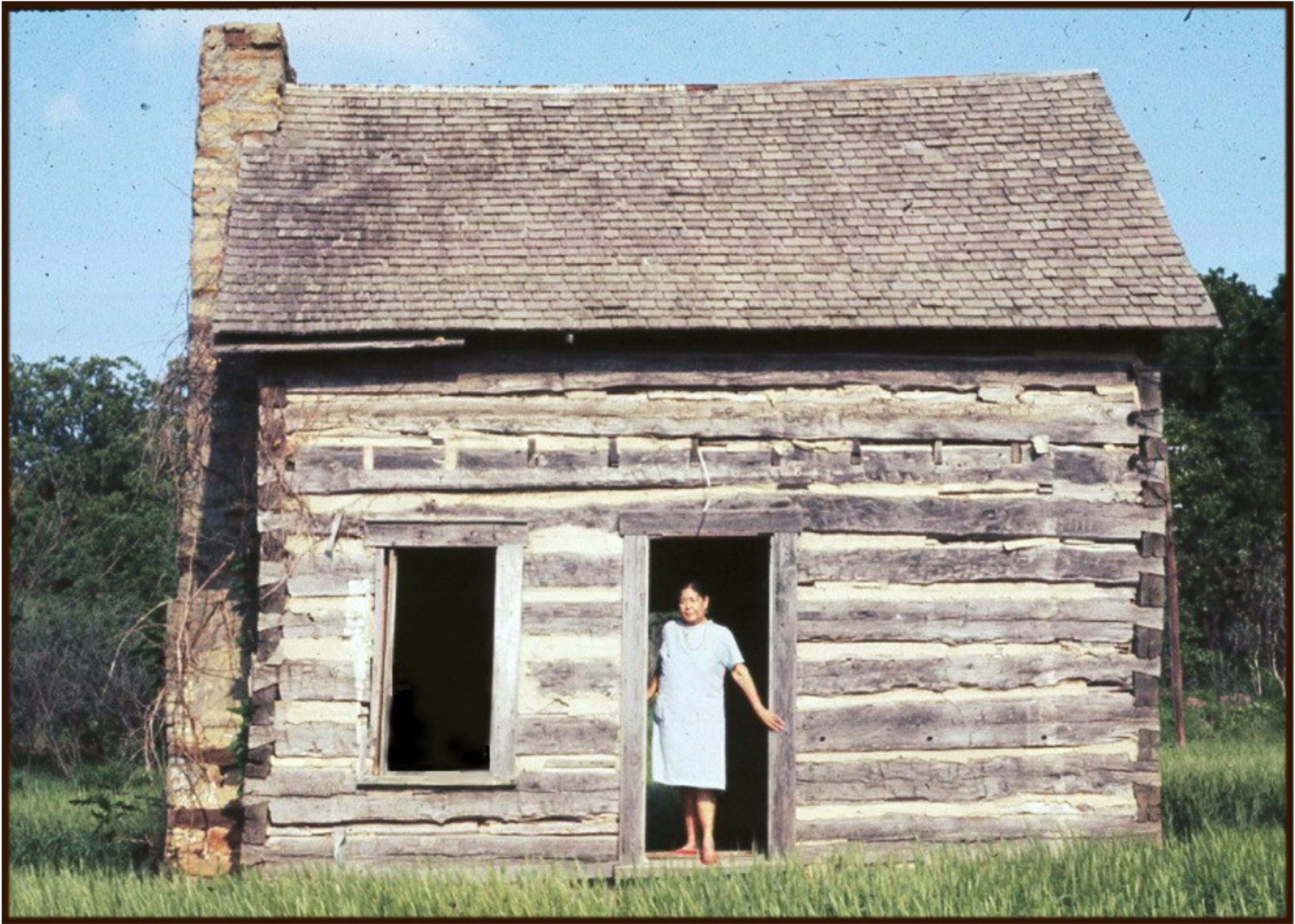
Mësakwikaon - Log House near Copan, Oklahoma