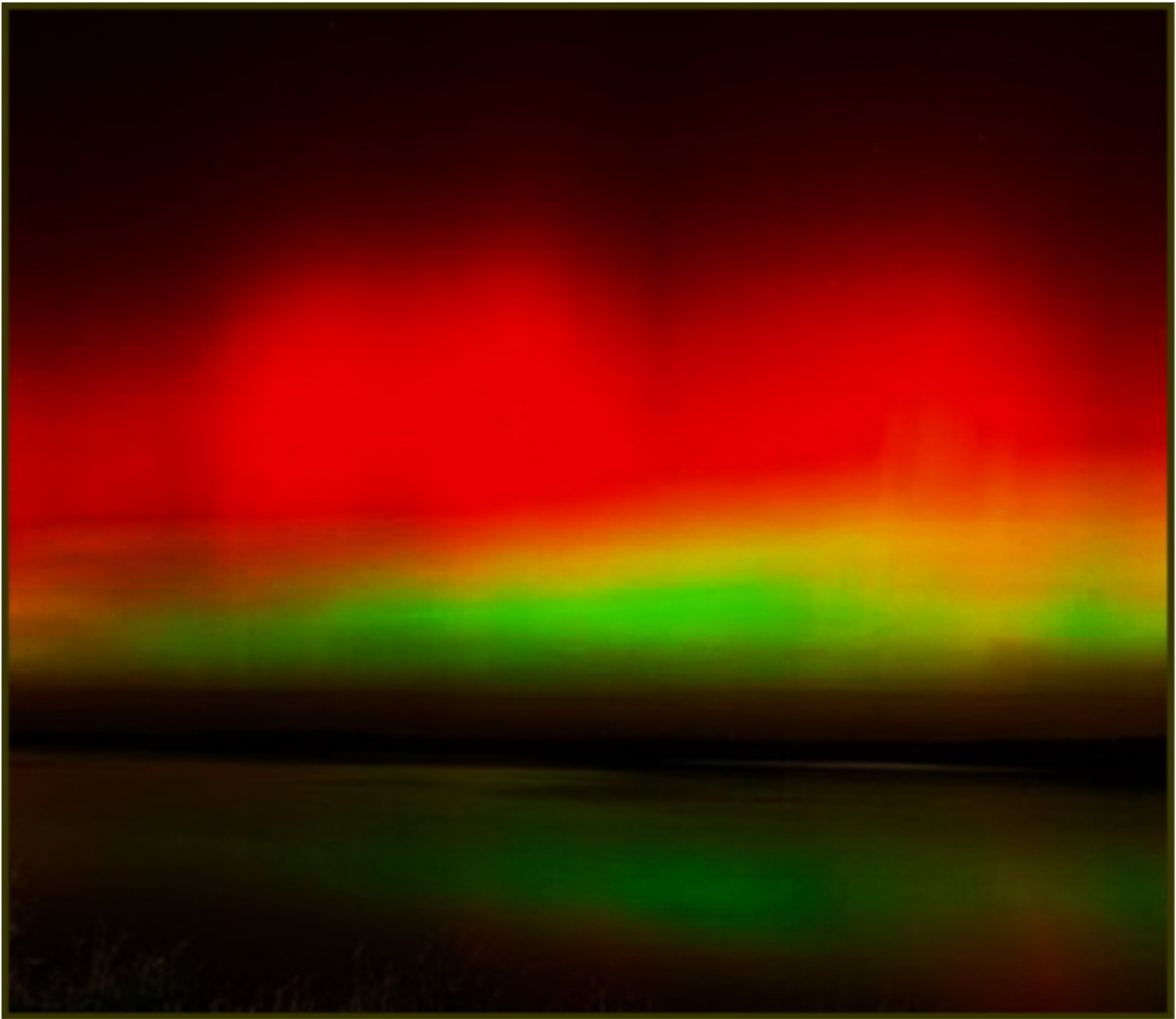
Kishahtèk - Aurora Borealis Over Copan Lake 14 November 2025 Copan, Oklahoma