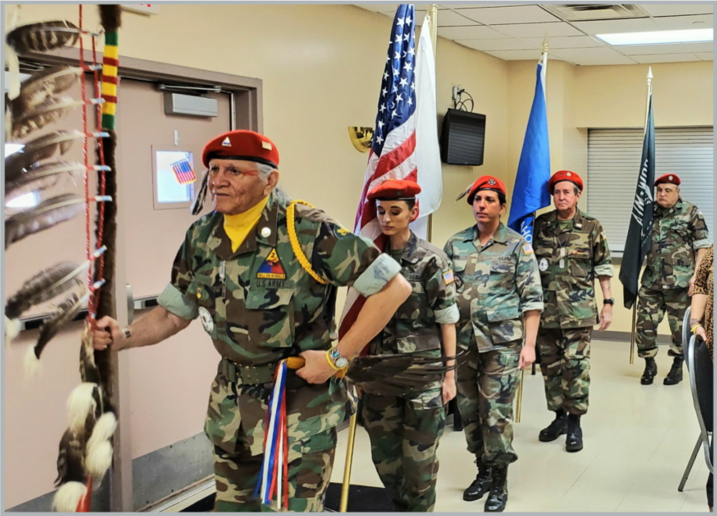
The Lenape Color Guard taken about 2020