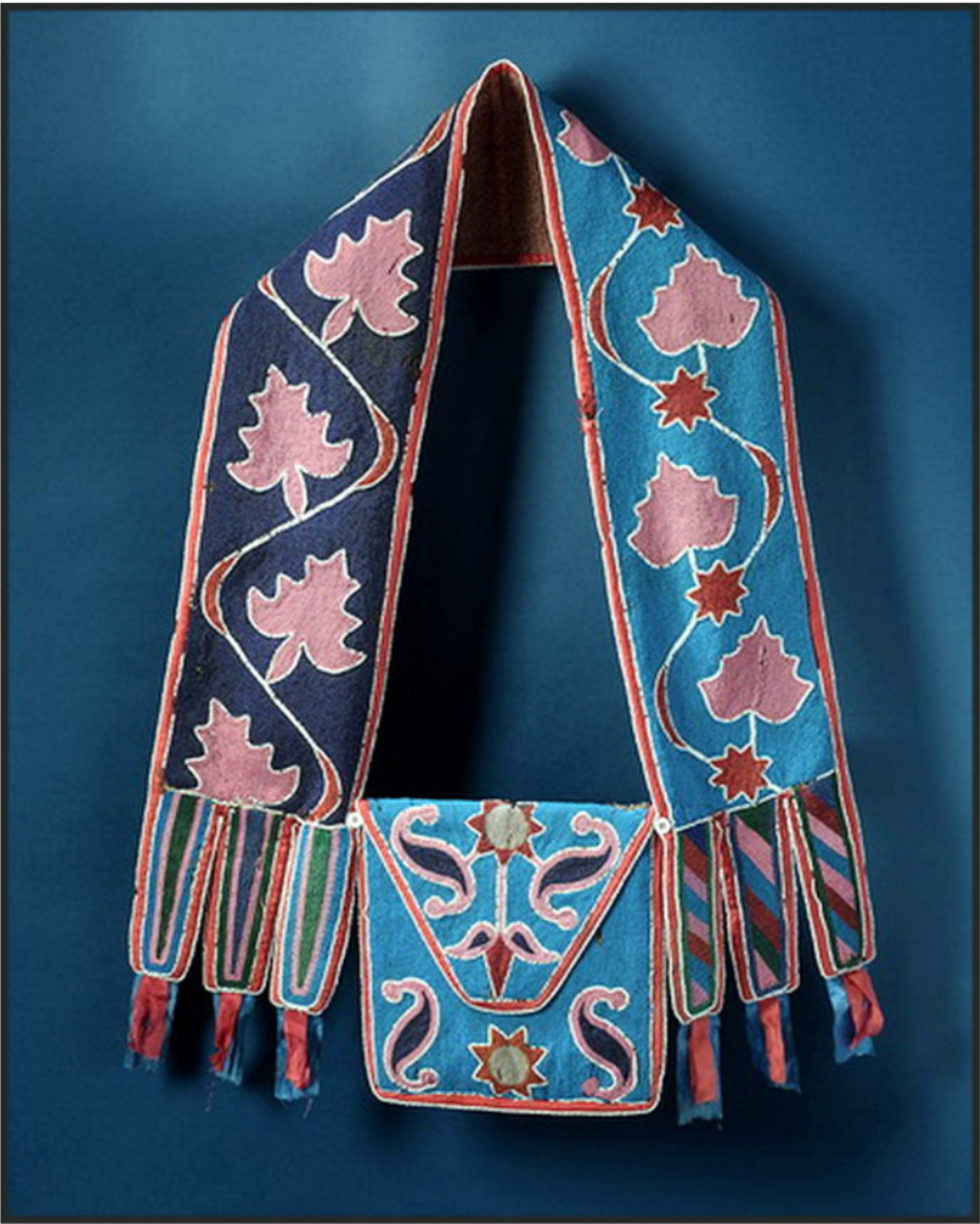
Pëntahsënakàn - Delaware Man's Bandoleer Bag