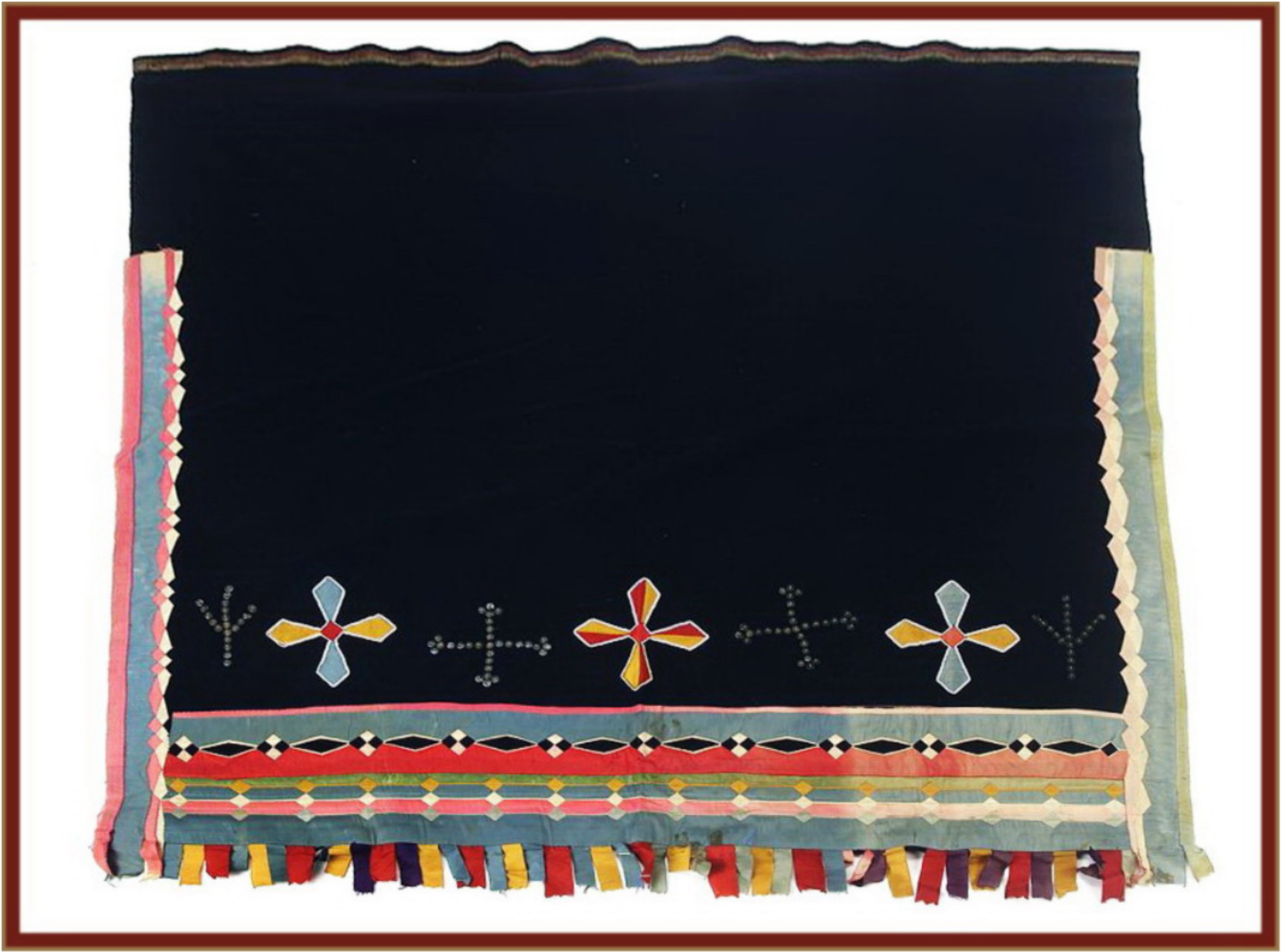
Delaware Woman's Traditional Blanket decorated with ribbon and beadwork